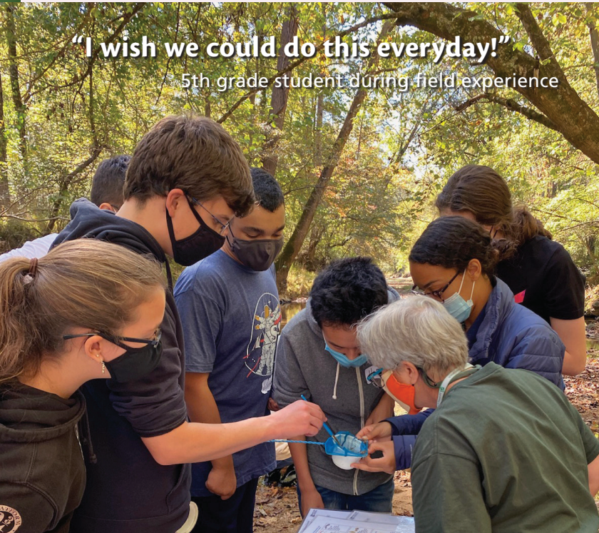
“I wish we could do this everyday!” 5th grade student during field experience

For the first time in two years, we welcomed school buses brimming with excited students back for our nature field trips. To address in-person learning gaps, we took our interactive nature discovery programs into communities and schoolyards, reaching over 12,000 people.